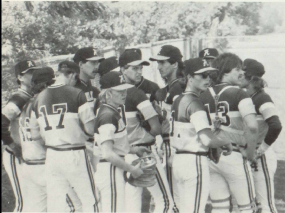
At pre-districts, the boys face tough competition. Before the game starts they gather around as a team to discuss such things as hustle, teamwork, and aggressiveness.